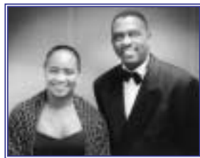
Barbara Hendricks and Moses Hogan

The Moses Hogan Singers are returning to Europe! On Monday, December 18, 2001 at the Sint Jan Cathedral in Hertogenbosch, and on Tuesday, December 19, 2001 at the Grote Kerk in Naarden, the Singers will join noted soprano Barbara Hendricks for two special concerts in the Netherlands. Sponsored by the Dutch bank, F. van Lanschot Bankiers N.V., these concerts are part of the Sint Jan Kerstconcert, a cooperative program between the two concert venues. Both venues, the Sint Jan Cathedral and Grote Kerk, represent some of the most precious cultural monuments in the Netherlands. Though the program is primarily for the Bank's "Special Relations" program, there will be a limited number of seats available. The concerts will be attended by some very distinguished guests, including Cabinet Ministers and members of the Royal Family.